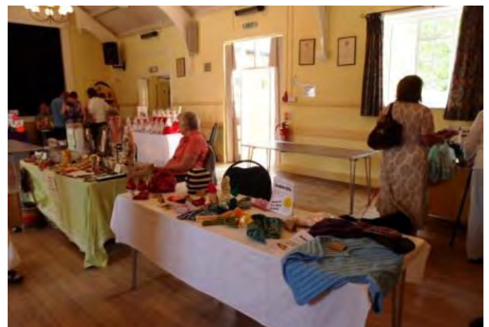
Knitwits & STOCC joining forces at the Craft Fair