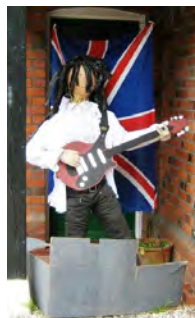
Scarecrows Around And about Stockcross