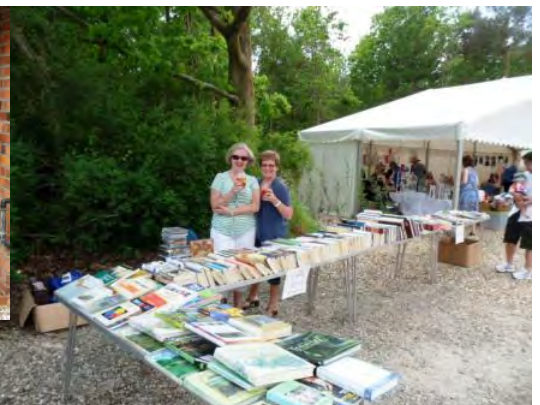
Déjà vu ?