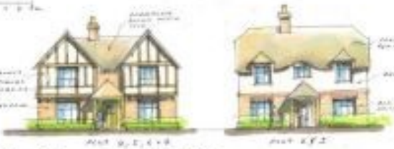
Not to Scale and concept draft only